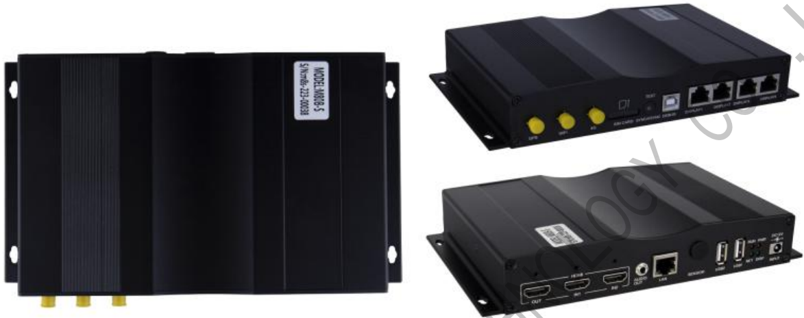
M80B-S Product Picture